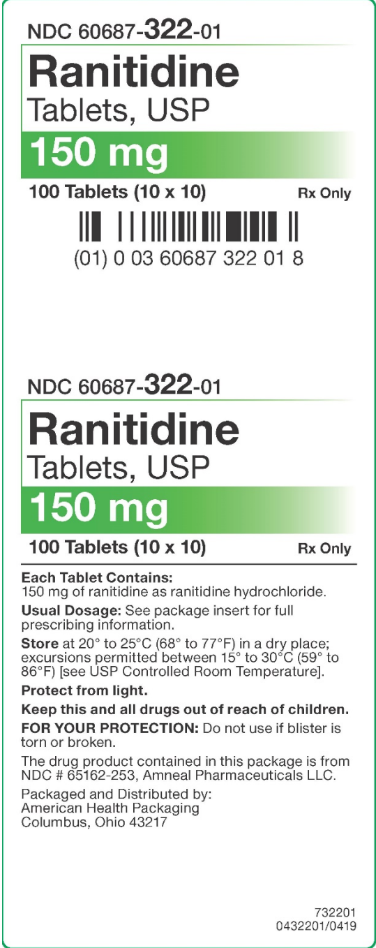
Old Label Style